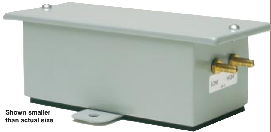
Shown smaller than actual size