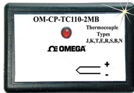
OM-CP-TC110-2MB, data logger, $299, shown actual size.