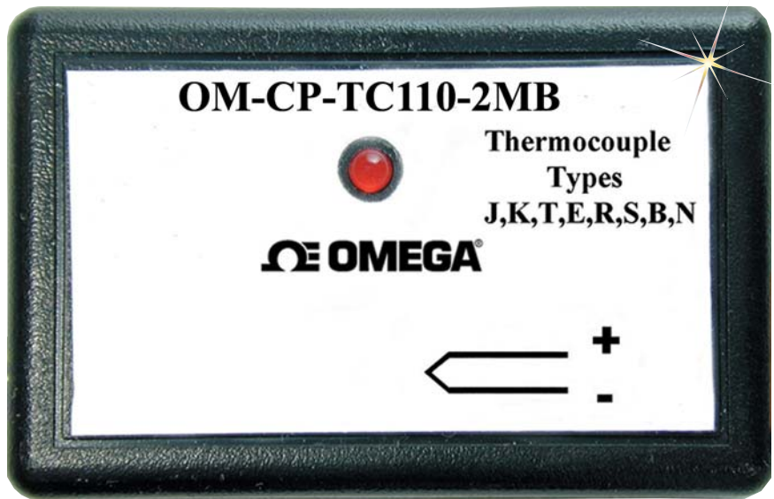
OM-CP-TC110-2MB data logger, $299, shown larger than actual size.