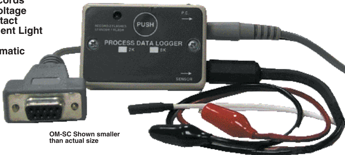
OM-SC Shown smaller than actual size