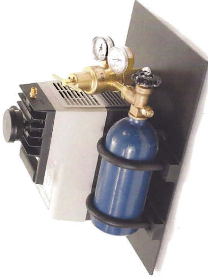
sai ™ AUXILIARY AIR & HELIUM SUPPLY