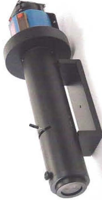
sai tm MODULATED ARC LAMP