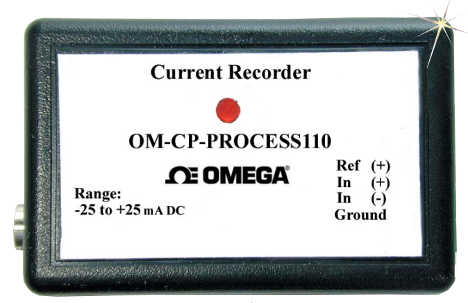
OM-CP-PROCESS110-25MA, $299, data logger shown larger than actual size

MA Recorder Current Range: 0.0 to 100.0 mADC NOMAD® OM-CP-Process 101 +